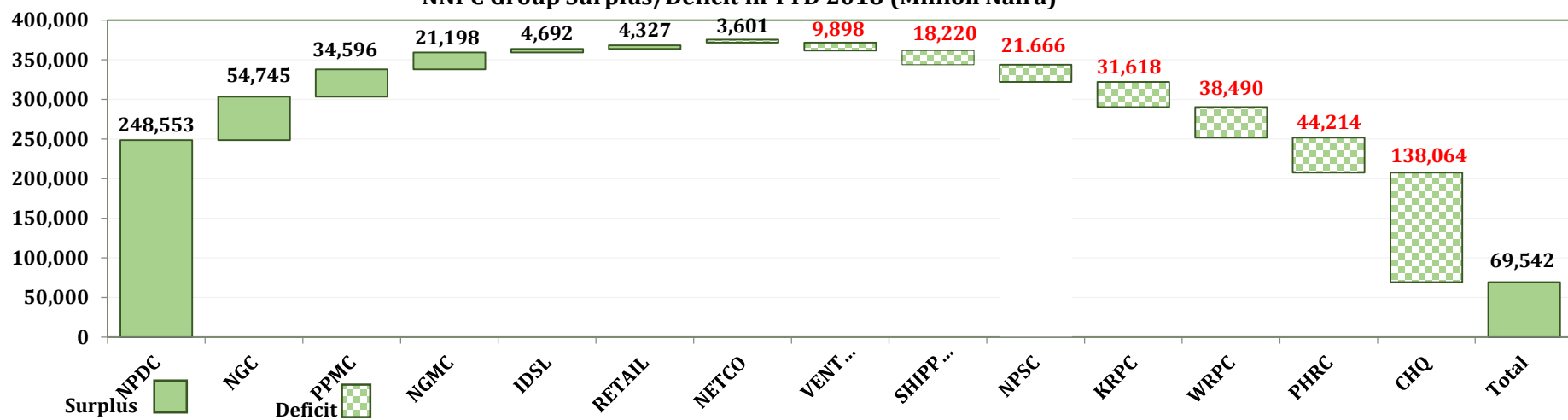
NNPC Group Surplus/Deficit in YTD 2018 (Million Naira)